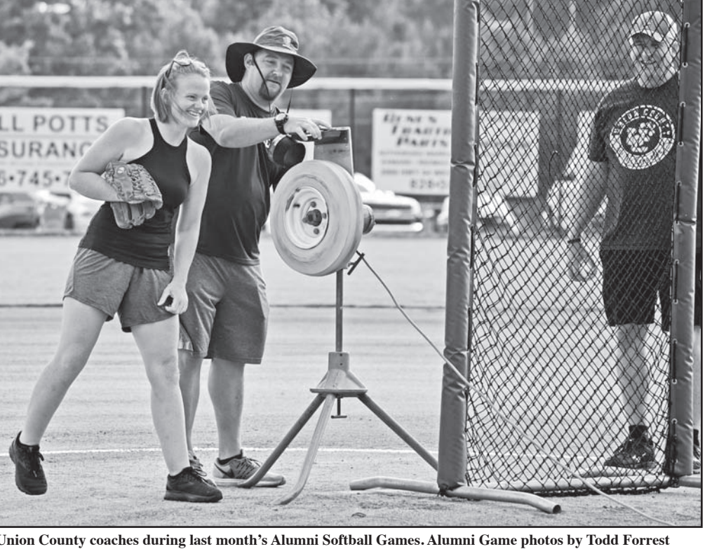
Union County coaches during last month's Alumni Softball Games.