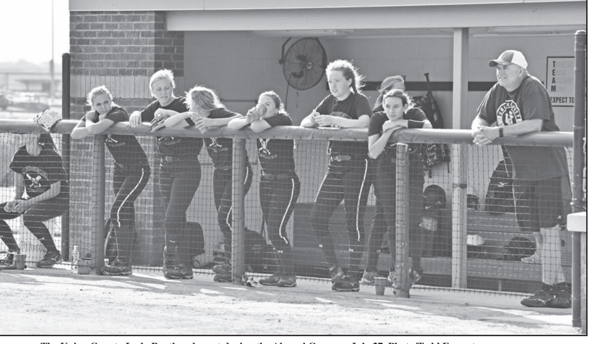
The Union County Lady Panther dugout during the Alumni Game on July 27.