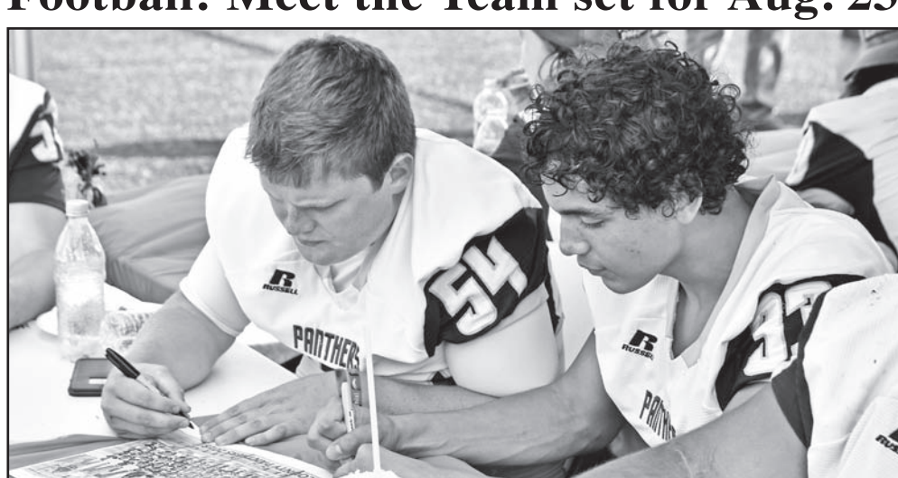
Panther football's annual Meet the Team event is scheduled for Friday Aug. 23 at 7 p.m.

Go online and register for Blairsville's first EVER color run 5k. This is open to kids, adults, grandparents, runners, walkers, joggers - anyone who would like some exercise while getting showered in color!